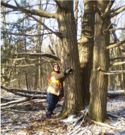
Historic Hemlock